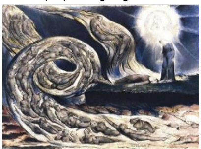
Figure 8: William Blake, HELL Canto 5, 1824 and 1827, lithograph print with pen, ink and watercolour. 37 x 53 cm.