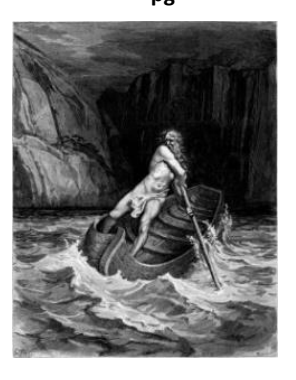
Figure 9: Gustave Dore, Inferno Canto 3, The River of Death, 21.4 x 33.4 cm