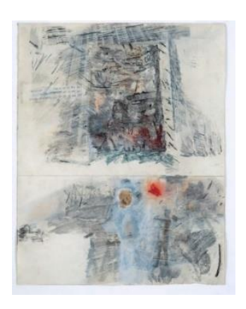
Figure 10: Robert Rauschenberg, Canto III: The Vestibule of Hell, 1958, 36.5 x 28.9 cm, The Museum of Modern Art, New York

pictures transferred with a chemical solvent from glossy magazine prints. (figure 10) (figure 11).