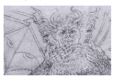
Figure 6: SANDRO BOTTICELLI, Inferno, Canto the Adoration of the ShepherdsIV, 1480s, Silverpoint on parchment, completed in pen and ink.

N. 2007), at a period when the poem's popularity was expanding. Between 1490 and 1496, Botticelli drew The Divine Comedy inferno canto (figure 6).