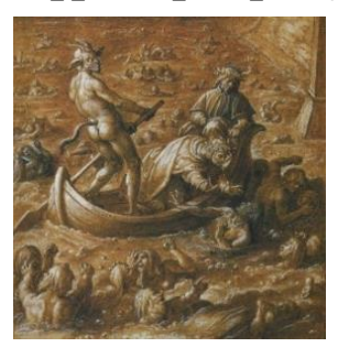
Figure 7: Giovanni Stradanus, illustration of Dante's Inferno, Canto 8, 1587.