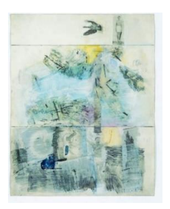
Figure 11: Robert Rauschenberg, Canto II: The Descent, 1958, 36.5 x 28.9 cm, The Museum of Modern Art, New York 4- Artist's Book Inspired from Dante's Inferno:

Incorporating technology and digital platforms into the creative process may be a highly effective method for encouraging creative exploration. The digital domain provides access to large stores of knowledge, artworks, and interactive tools that can encourage artists to experiment with new approaches and materials, Artists can broaden their creative boundaries and explore unexplored territory by embracing technology breakthroughs, the researcher embarked on an artist's book project inspired by Dante's Inferno, following in the footsteps of artists like Blake and Doré. Using the current technology of CTP printing, the researcher created a series of high-quality prints that capture the spirit of Dante's vision. The resulting artist's book portrays Dante's Inferno in a fresh and interesting way while honouring the rich history of Dante's works, n this stage, the researcher will focus on the outcome of 15 editions of black and white prints created using the computer-to-plate (CTP) technique, all of which have been inspired by Dante Alighieri's Inferno chapter. To achieve our research goal, we will employ a comprehensive research framework consisting of using the main