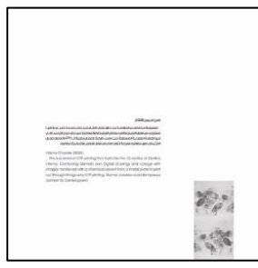
Figure 12: on the right, the cover of inferno book 50 x 100 cm, on the left the first 2 pages of introduction of the book statement - Digital print, 2020s.